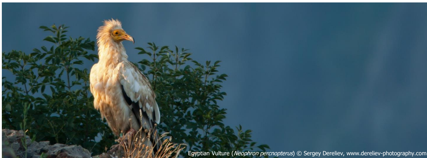
Egyptian Vulture ( Neophron percnopterus )