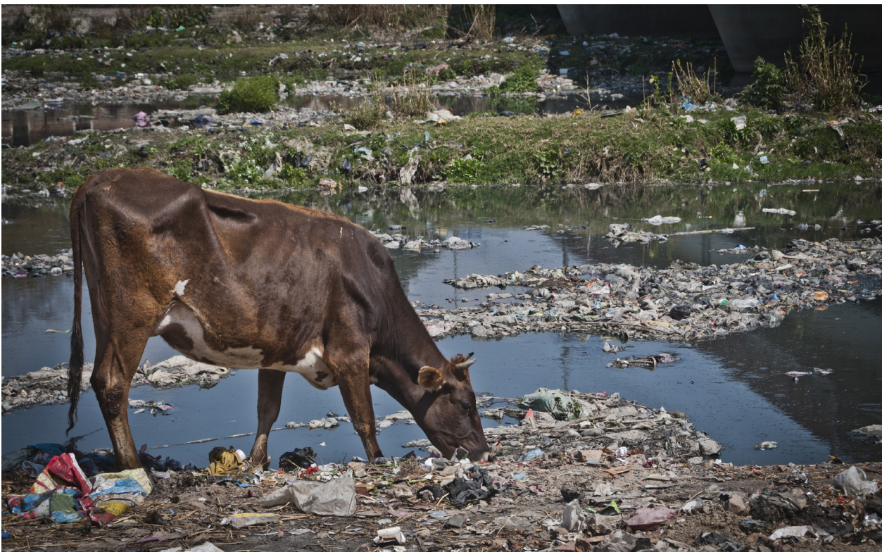
Figure 5. A cow feeding amongst waste on the banks of the Bagmati River, Kathmandu, Nepal.

An example of land mammals in Asia (and elsewhere) affected by plastic ingestion are ruminants such as cows,