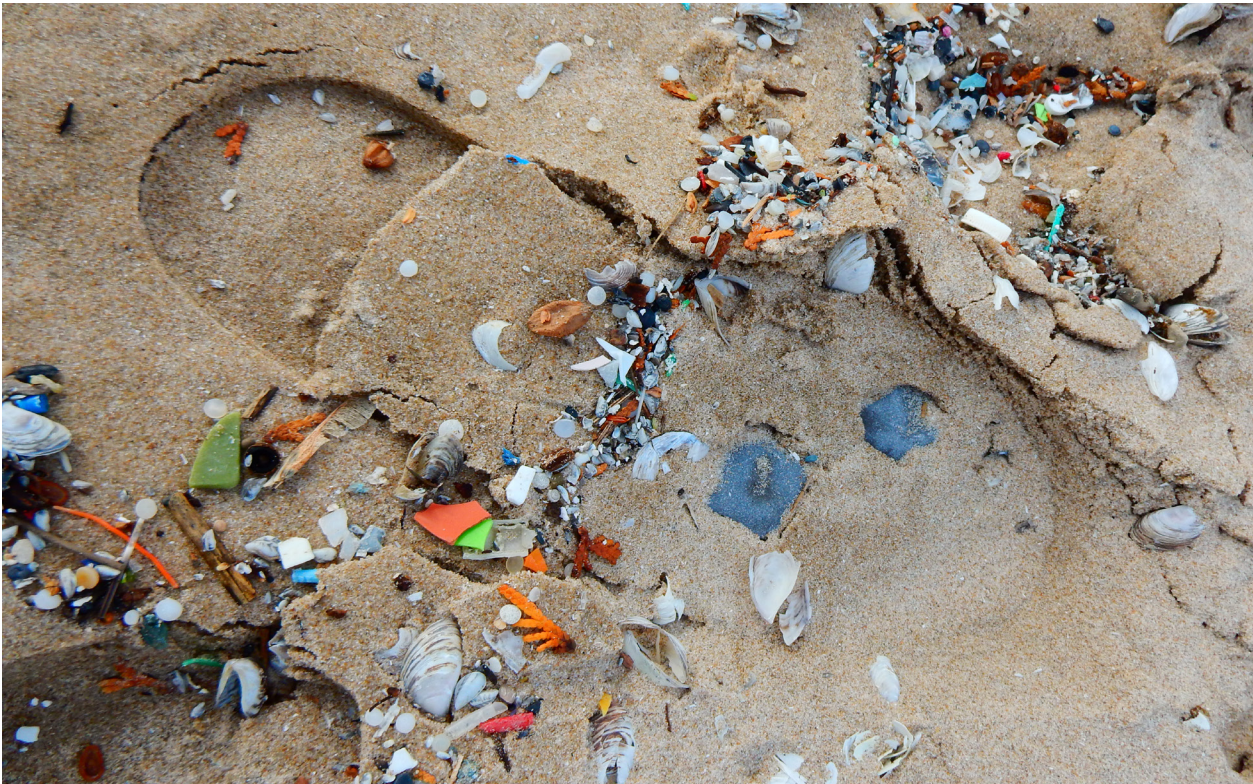
Figure 1. Plastic items of various sizes on a beach.

will continually change. These varying environmental concentrations will significantly influence exposure of organisms to microplastics over time 47 . For example, some areas will be natural accumulation zones, and many will also be seasonal in relation to rainfall and flow conditions. For example, in the UK, microplastic concentrations in river sediments were found to be much reduced following flooding, leading to resuspension of microplastics from sediments and subsequent flushing of microplastics downstream 48 . In the Ganges, the concentration of microplastics was found to increase with increasing distance from the source of the river, with the highest concentrations found towards the estuary, although in a similar concentration range to other freshwater studies 4,49 . With respect to seasonality, it would be expected that the monsoon would have a significant influence on microplastics transport and mobilisation and thus water concentrations; the same study found that surface water concentrations of microplastics were higher pre-monsoon, likely due to monsoon rains diluting and flushing out microplastics 49 .