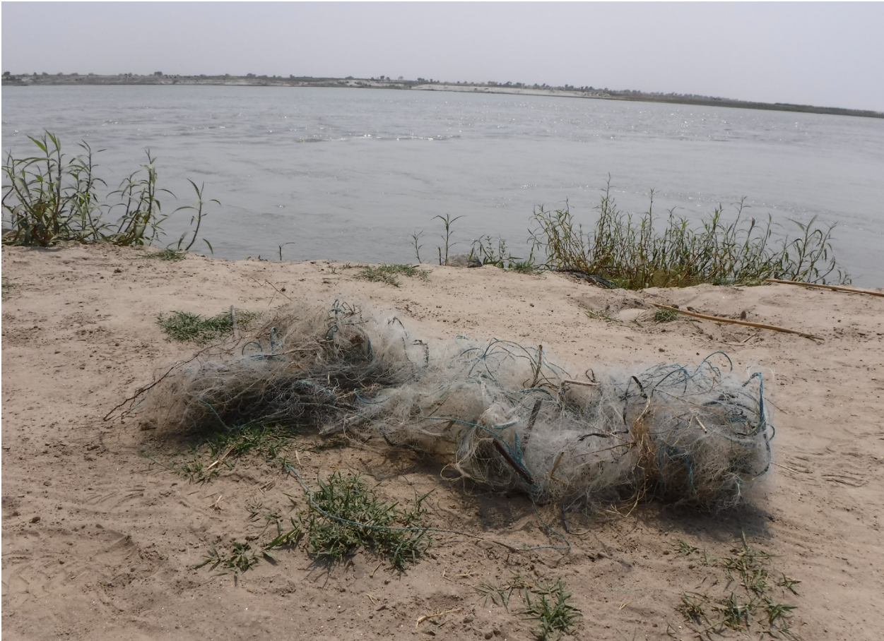
Figure 10. Discarded fishing gear on the banks of the Ganges River.