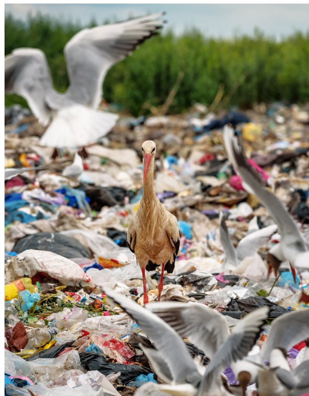
Figure 9. White Stork on a rubbish dump.

Black-footed Albatrosses ( Phoebastria nigripes ) and Laysan Albatrosses ( Phoebastria immutabilis ), both listed in CMS Appendix II, appear to be particularly vulnerable to plastic ingestion. This is likely due to their feeding strategy, selecting floating items from the ocean surface. In the time before the abundance of plastics, these items would have been dominated by organic matter and neustonic (floating) organisms. However, the growing prevalence of plastics in some areas means these can be difficult for albatrosses to distinguish, leading to accidental ingestion 160 . These may then accumulate in the gut or be passed to offspring through regurgitates. Plastics from degraded post-consumer products have been observed in the digestive contents of albatross chicks in the Midway Atoll (North Pacific). In the study, Black-footed Albatrosses tended to ingest more fishing line, while Laysan Albatrosses ingested more fragments. A greater incidence of fishing line appeared to correlate with an abundance of fish eggs in their digestive contents 161 . This preference of Black-footed