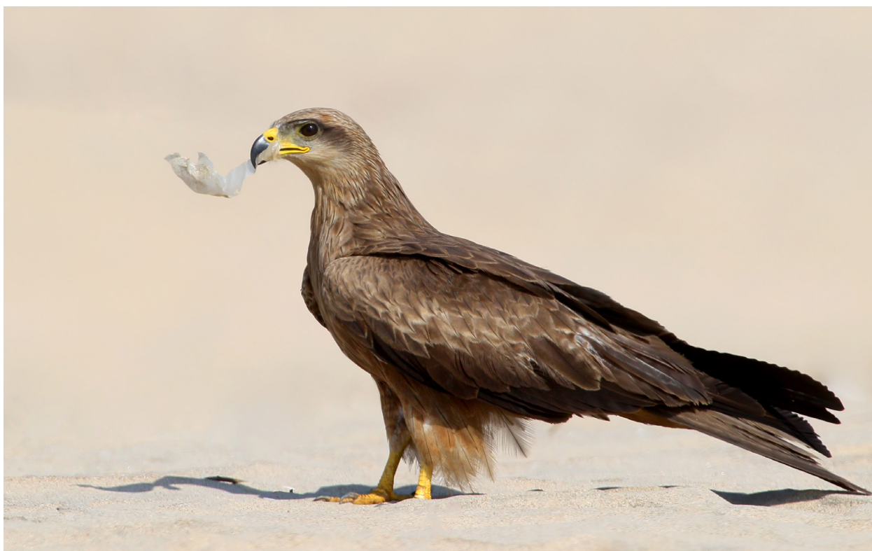
Figure 8. Black Kite with plastic in its beak, possibly being collected for nest construction.

Fishing line also poses a threat for other waterbirds and land birds, when incorporated in nest construction and when birds forage in habitats near wetlands. Kite strings are especially an issue for land birds, and have been estimated as the second most frequent source of plastic interaction after fishing line 151 . Regarding entanglement of coastal and river-dependent birds, the CMS-listed coastal