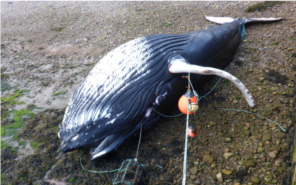
Figure 4. Dead Humpback Whale ( Megaptera novaeangliae ) (CMS-listed species found globally, including Pacific and Indian Oceans) entangled in fishing lines.

Evidence relates not only to the physical presence of ingested plastics but also indirect evidence of ingestion. In Norway, Harbour porpoises were found to contain phthalate chemical derivatives (resulting from plastic additives, thus acting as an indicator of plastic exposure) within their livers. These chemicals were shown to lead to a reduced body size. These studies therefore show both direct and indirect consequences of plastics and associated chemical contaminants to this CMS-listed species in the wider environment 126 . Another marine mammal on the CMS list in the region of interest is the dugong ( Dugong dugon ), which have been shown to become entangled in fishing nets and drown 127 , in addition to ingesting plastics, leading to death 128 . In general, interactions of cetaceans (including whales, dolphins and seals) with plastics are much more widely reported within marine systems than freshwaters (Fig. 4) 129-131 .