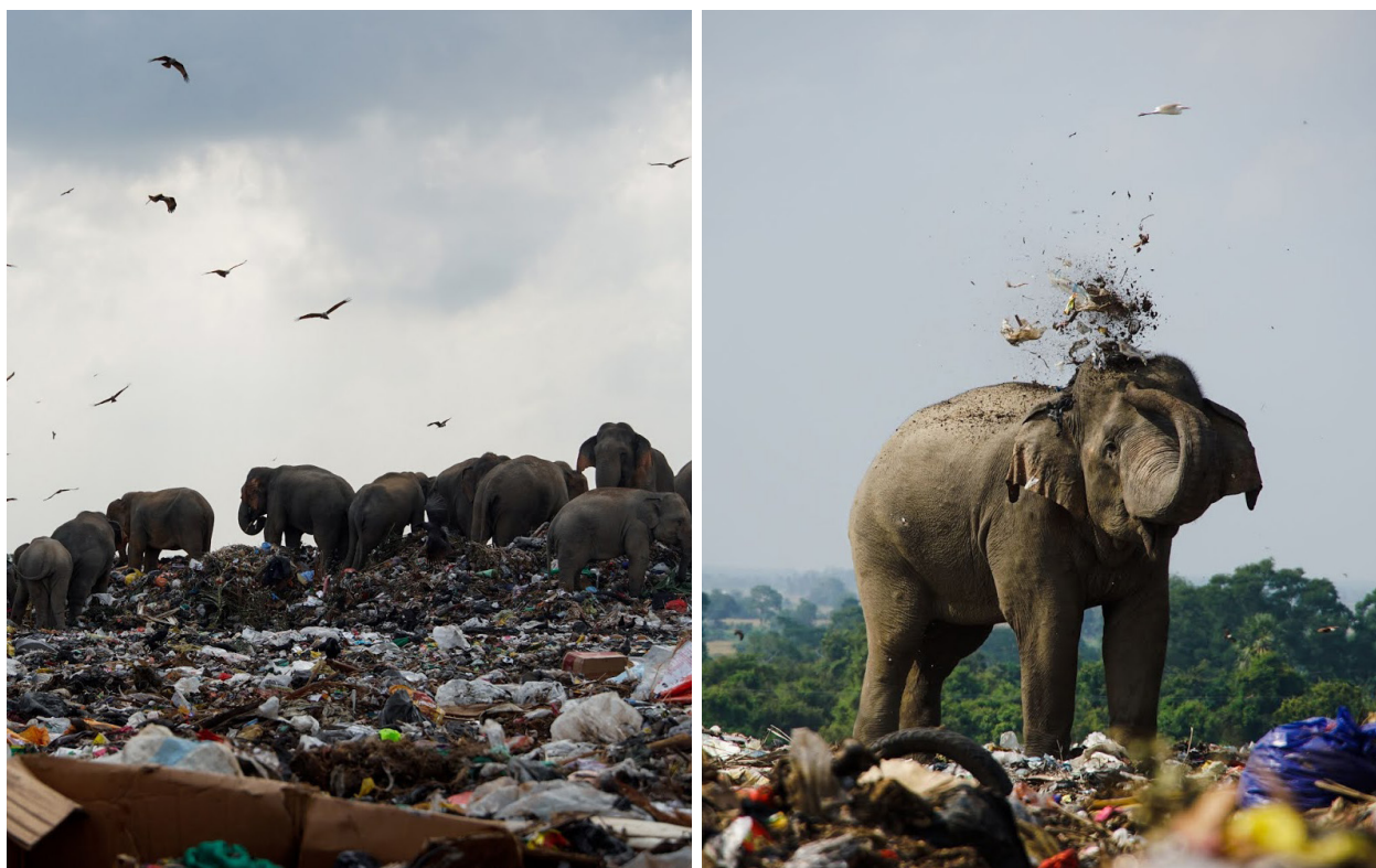
Figure 6. A group of Indian Elephants foraging on a rubbish dump in Oluvil, Sri Lanka.

There are no concrete reports of plastic ingestion by big cats on the CMS list: Lions ( Panthera leo ), Cheetahs ( Acinonyx jubatus ), Leopards ( Panthera pardus ) and Snow Leopards ( Uncia uncia ). Nonetheless interactions have been observed, for example a leopard was photographed carrying a plastic bottle in its mouth in the Masai-Mara game reserve, Kenya (Fig. 7). With respect to the more elusive Snow Leopard, and the other big cat species, no sightings of plastic interactions have been reported. Many other terrestrial mammals are listed within CMS appendices I and II, including bats, horses and ruminants such as mountain sheep and yaks, however no documented evidence of interactions with plastics can be found for most of these species.