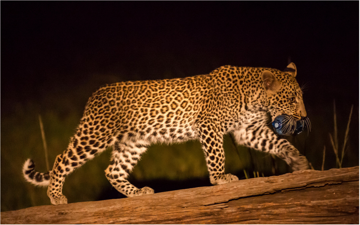
Figure 7. A leopard carrying a plastic bottle in its mouth, in the Masai-Mara game reserve, Kenya.