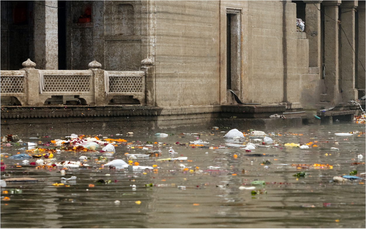
Figure 2. Litter floating in the Ganges River at Varanasi.

following the ban in 2002 which, in the first few years after the ban, was suggested to lead to reduced severity of flooding in the capital city Dhaka, due to reduced clogging of waterways with plastic litter 87 .