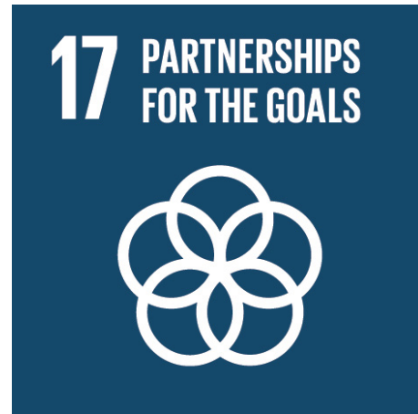
SDG 17: strengthen the means of implementation and revitalize the global partnership for sustainable development.

More than half of the IAEA technical cooperation (TC) programme activities implemented in Member States address areas, in partnership with other United Nations organizations, such as human health, food and agriculture, and water and the environment. Effective partnerships therefore are essential for achieving tangible socioeconomic impact in Member States. Over the past 60 years, the IAEA and its TC programme has entered into partnerships with many organizations and institutions, and has established successful long term collaboration with the Food and Agriculture Organization of the United Nations (FAO) and the