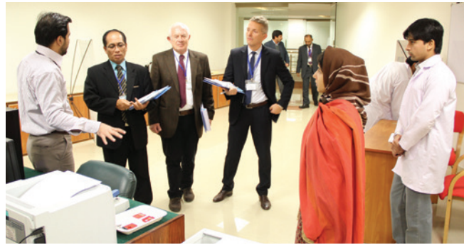
Preparatory EduTA, Pakistan

Final report: two months after the mission.