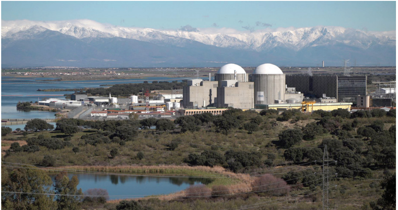
Almaraz NPP, Spain