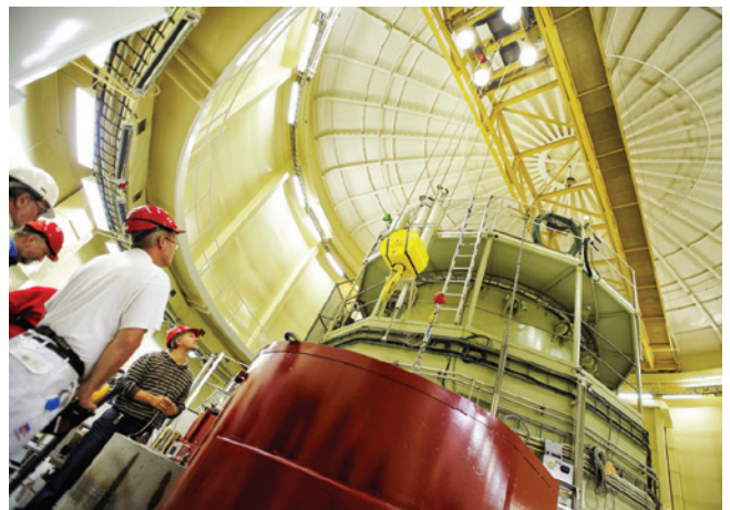
Inside of the JEEP II reactor at the Kjeller research centre, Norway