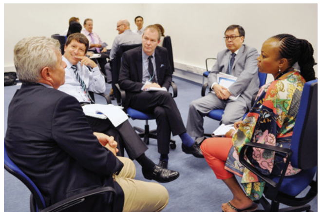
ISCA workshop, Vienna, Austria