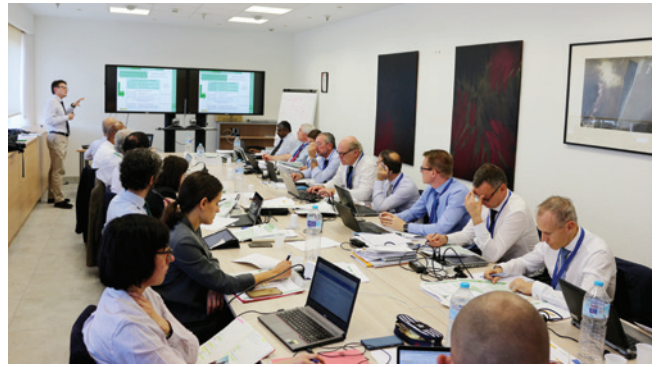
ARTEMIS mission, Spain

Final report: two months after the mission.