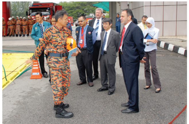
EPREV Mission, Malaysia