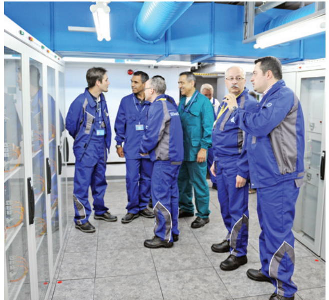
TSR mission, Kozloduy NPP