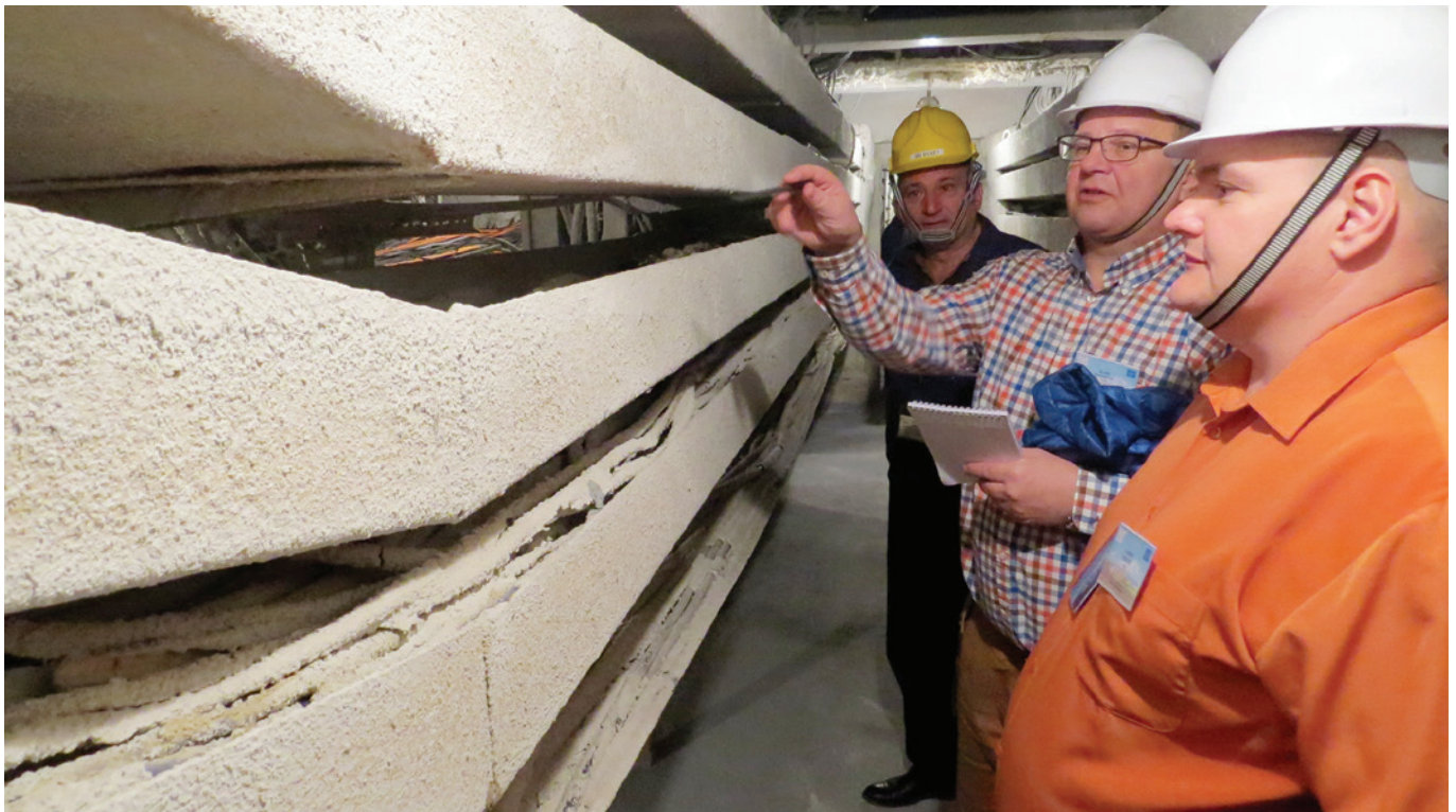
SALTO Mission, Armenia NPP

Final report: three months after the mission.