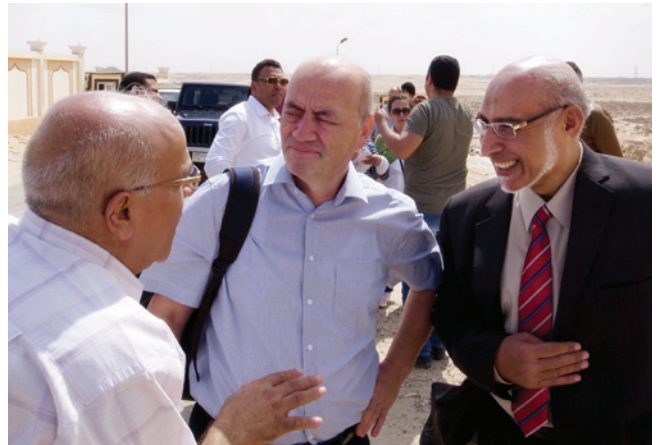
SEED mission, Egypt

Final report: delivered according to an agreement at the preparation of each TSR service.