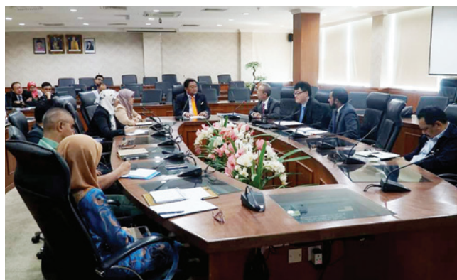
INSServ kick off meeting, Malaysia

Final report: two months after the mission.