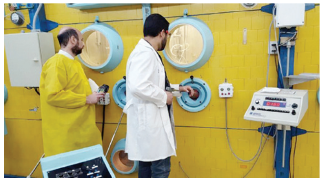
ORPAS mission, CCHEN Atomic Centre Lo Aguirre, Chile