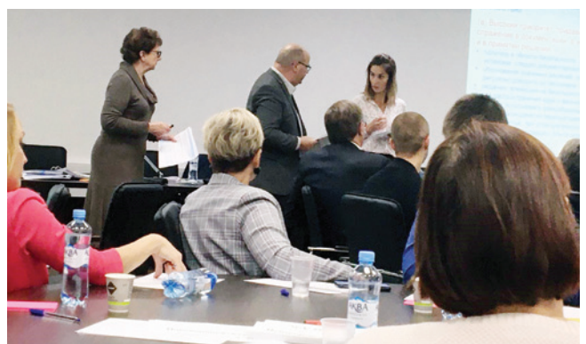
SCCIP training, Moscow