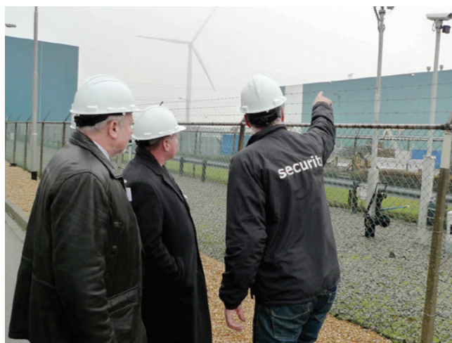
IPPAS follow-up mission, The Netherlands