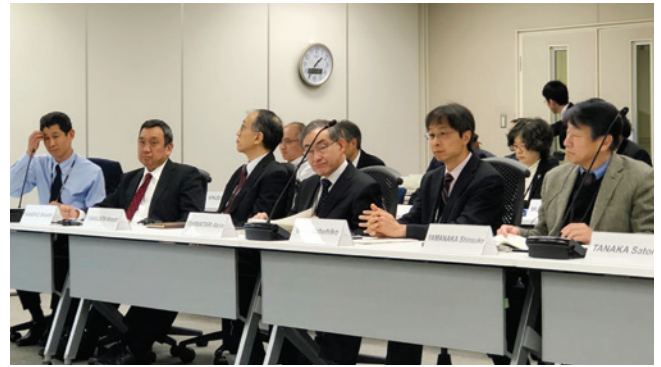
IRRS mission, Japan.

Final report: two months after the mission.