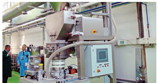
SEDO mission, Romania