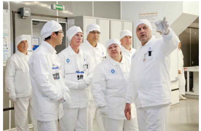
OSART mission at Rosenergoatom Joint-Stock Company, Russia