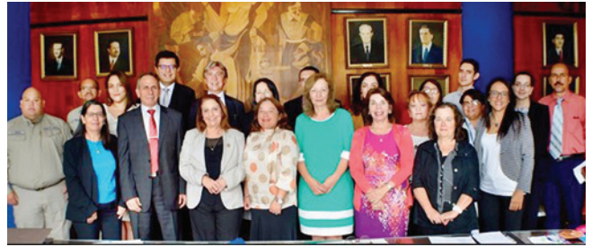
Participants of the RISS mission, Costa Rica

Final report: three months after the mission.