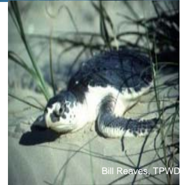
Bill Reaves, TPWD

Participating countries: Cameroon, Gambia, Ghana, Senegal, Seychelles, Kenya, Mozambique, Tanzania Funding: GEF: US$ 6M, Nat. Gov.: US$14.5M, others: US$2.6M Project Status: Project Management Structure established, Inception Workshop planned for July 2009 ( first year of implementation ) Impacts to date: Tourism stakeholders mobilized (9 countries) Best Available Techniques / Best Available Practices currently being compiled