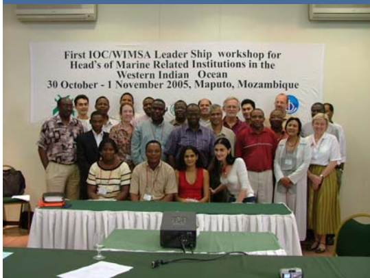
Participants at the first leadership workshop for directors, Maputo, October 2005