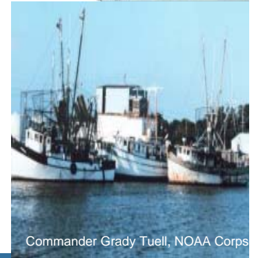
Commander Grady Tuell, NOAA Corps

GESAMP: Co-sponsor of two working groups: Mercury in Oceans (WG 37) Proposed WG - Global Trends in Pollution of coastal ecosystems. Un-Oceans UN-Water Lead on issues relating to Water Productivity and Water Use by Industry.