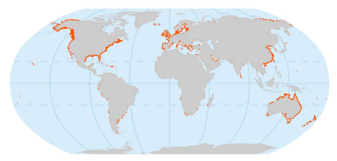
The boundaries and names shown and the designations used on this map do not imply official endorsement or acceptance by the United Nations.

Figure 1. Salt Marshes (in orange).