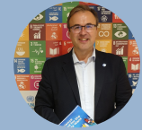
DR. CARLOS GARCIA-SOTO

During its third cycle, the Regular Process will continue to help provide a clear picture of the status and trends of the oceans, the main threats they face, and the possible outcomes of different courses of action to mitigate these threats. The GOE reports to an Ad Hoc Working Group of the Whole of the General Assembly. Thus, it is in a position to draw to the attention of the most significant policy-making body of the UN the results that might be expected for us and future generations from the decisions we make concerning the marine environment.